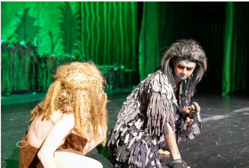
Ape costumes as well as Kerchak and Kala