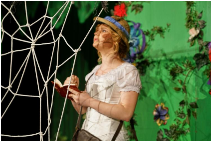
Full Set Pictures and spider web